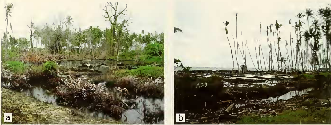
Figure 4. Terrestrial tsunami damage at Pulau Baleh showing (a) dead vegetation along the coast and (b) foundations of buildings that have been washed away by the tsunami wave.

The houses remaining along the seafront were noted to all have a clear brown mark at approximately 80 cm height up their walls (Fig. 5). It seemed strange for this water mark to remain so clear 10 months after the tsunami hit, but having spoken to the islanders it became apparent that this was an effect of the earthquake as opposed to the tsunami wave. The island had subsided as a result of the December 2004 earthquake and as a result, the buildings along the seafront are now inundated with up to 1 m of water during each high tide. Presumably the coral reefs surrounding these islands must also have submerged by a similar amount, converting intertidal reef-flat communities into subtidal ones.